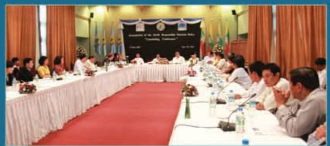
Stakeholders formulating the Responsible Tourism Policy in Nay Pyi Taw.

“Building a viable and sustainable tourism industry in Myanmar requires strong public and private sector partnerships”