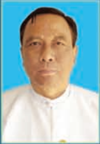
H.E. U Htay Aung, Union Minister, Ministry of Hotels and Tourism

The Ministry of Hotels and Tourism of the Government of the Republic of the Union of Myanmar has embarked on its initial reform strategies for the tourism sector since March 2011, which included smooth entry of foreign visitors to Myanmar, enhancement towards quality service in hospitality, enhancement of standards in service providers and promotion of all year round tourism destinations.